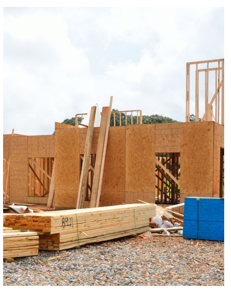
"Planning is the most important step in the construction process."